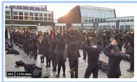
Chinese Morning Exercise and eye massage