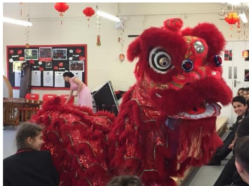
Chinese Dragon costume